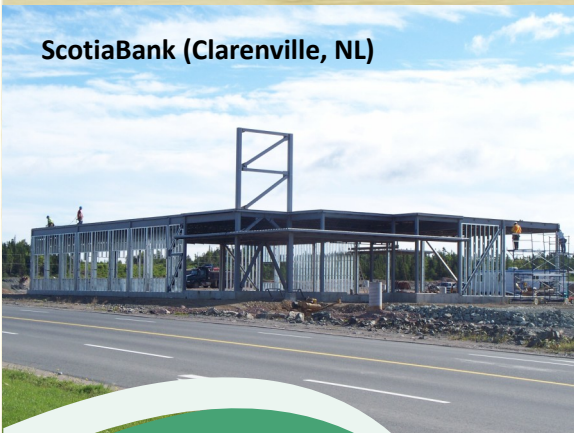
ScotiaBank (Clareville, NL)

Bringing innovation to the next level... ...that's the power of RAMP