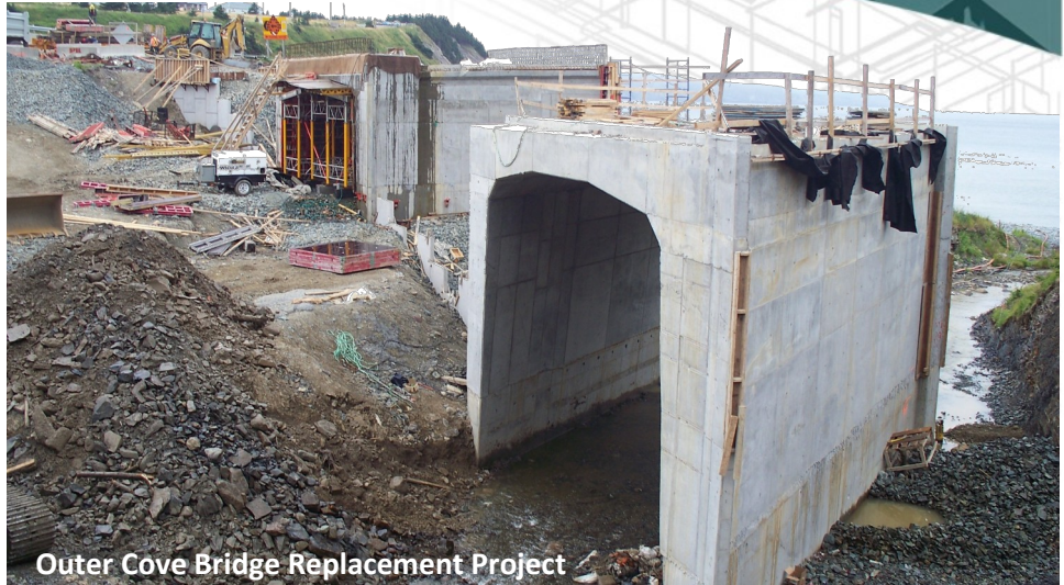
Outer Cove Bridge Replacement Project